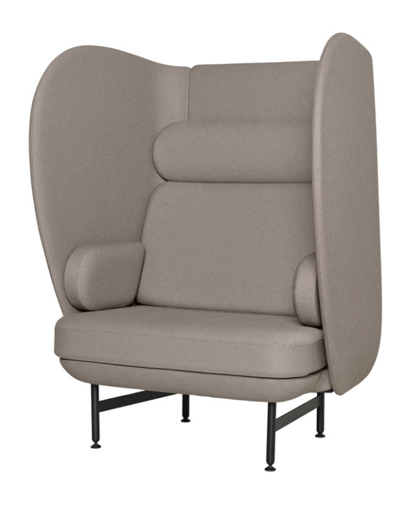
REPUBLIC OF Fritz Hansen®

With Plenum™ we are paying homage to modern workspaces and making room for collaboration. This high-back sofa system designed by Jaime Hayon is fit for embracing any space – whether the need is to be individual together or simply together. Plenum is crafted for durability that is reflected in the challenging process of creating a curvy design with no wrinkles and without using glue. The result is a vigorous, versatile design with the possibility of re-upholstery whenever needed.